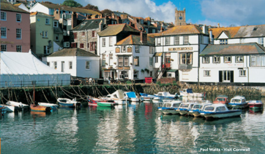
Paul Watts - Visit Cornwall