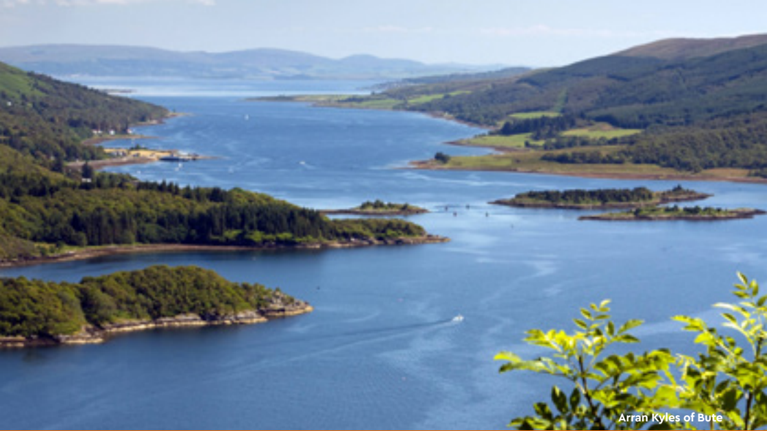
Arran Kyles of Bute